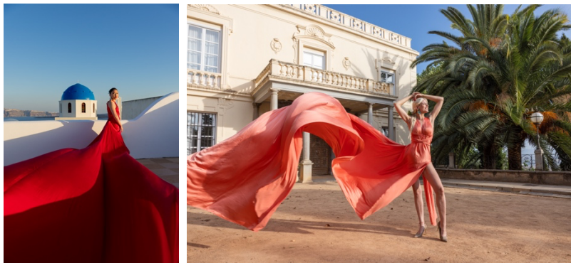
FLYING DRESS FOR RENT

The more variety you bring, the more creative range you'll have in your photos. Think color, silhouette, fabric, and style mood!