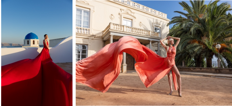
FLYING DRESS FOR RENT

The more variety you bring, the more creative range you'll have in your photos. Think color, silhouette, fabric, and style mood!